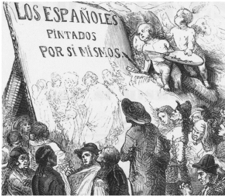
Fig. 1-1 23