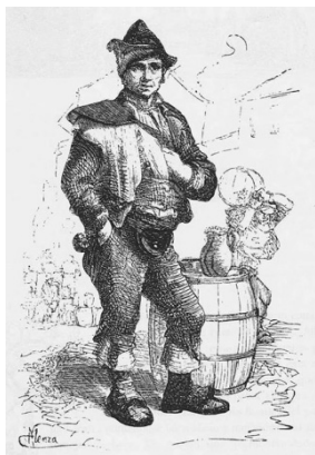
Fig. 1-3 28

On the left one can see the Spanish original taken from the sketch collection “Los españoles pintados por sí mismos”, on the right appears the Mexican version.